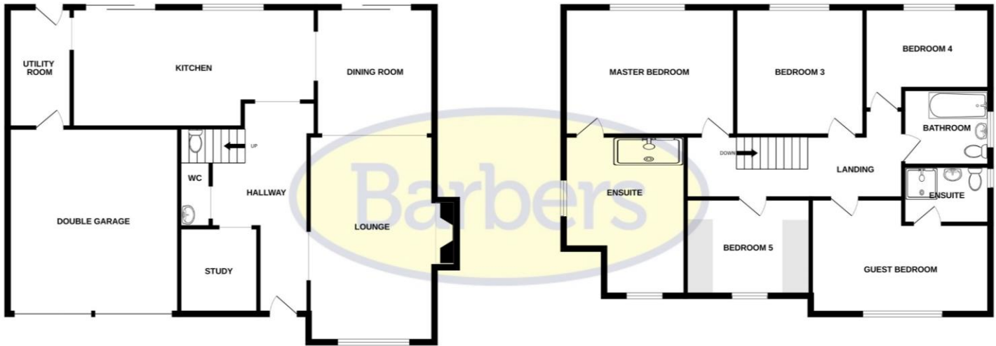
1ST FLOOR 1054 sq.ft. (98.0 sq.m.) approx.

TOTAL FLOOR AREA : 2197 sq.ft. (204.1 sq.m.) approx. Made with Metropix ©2025