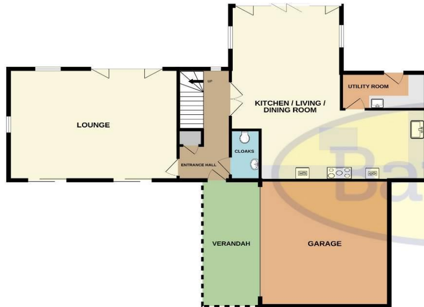
GROUND FLOOR 1313 sq.ft. (122.0 sq.m.) approx.