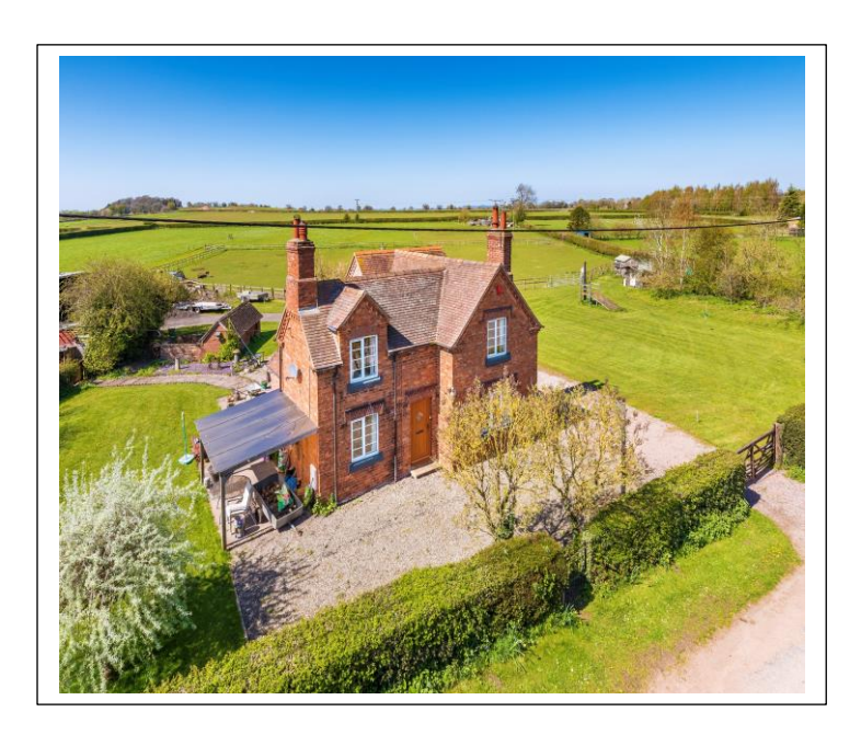
18 Cherrington, Newport

This floor plan has been prepared for the exclusive use of Barbers Estate Agents. All due care has been taken in the preparation of this floor plan which should be used for illustrative purposes only. All sizes and dimensions of rooms and walls are approximate. The positioning of windows, doors, openings, fixture and fittings are approximate and for use as a guide only. This floor plan is not, nor should it be taken as, a true and exact representation of the subject property. Plan produced using PlanUp.